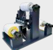
Matrix Remover & Slitter