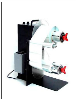
TWIN-CAT-2 CHUCK with INSP-1 & PC-1